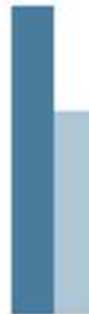
Tooling Cost Reduction