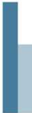
Number of Stampings