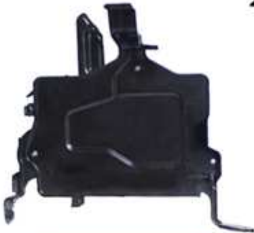
Original Customer Part