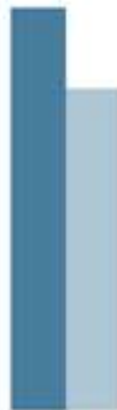
Number of Welds