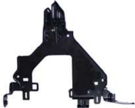
Advance's Custom Engineered Part