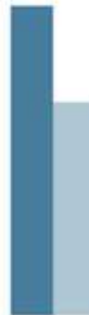
Piece Price Reduction